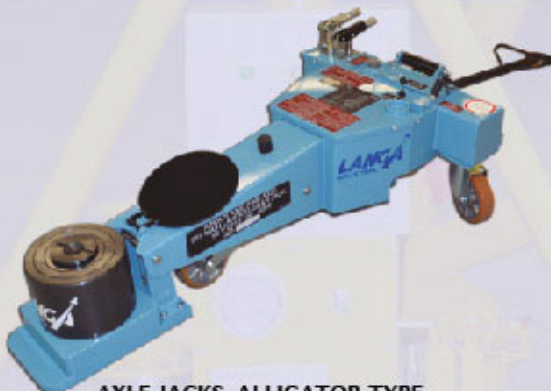
AXLE JACKS. ALLIGATOR TYPE. From 3 to 150 Tons.