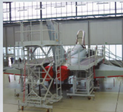
Eurofighter Docking System