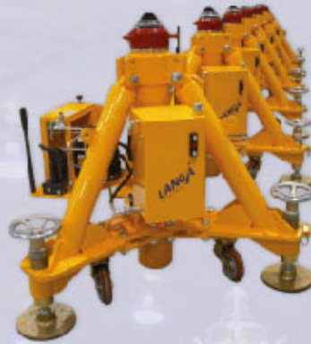
TRIPOD JACKS. NARROW AND WIDE BODY AIRCRAFT TYPE AND FOR REGIONAL JETS. From 3 to 150 Tons.