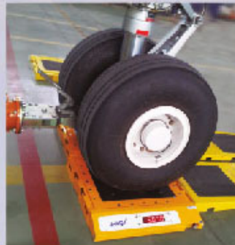
AIRCRAFT WEIGHING SYSTEM