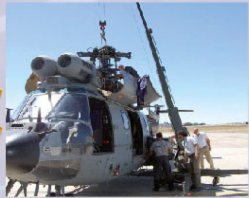
MOBILE MAINTENANCE CRANES. Lightweight, foldable, portable and airtransportable for maintenance tasks on field deployment missions.