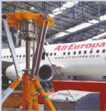
PORTABLE UNIVERSAL JACK TESTER for PART-145 checkings