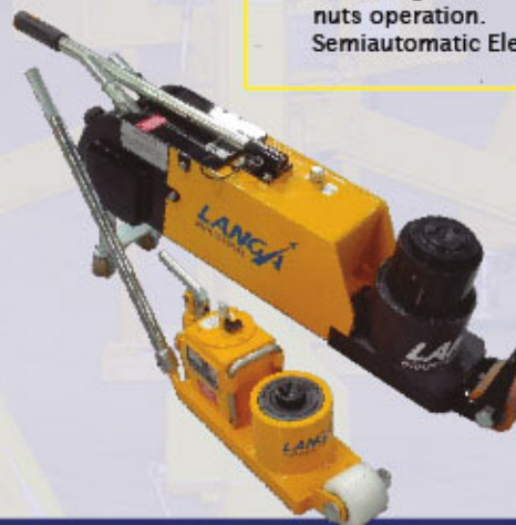
AXLE JACKS AND FLYAWAY JACKS From 3 to 30 Tons.

LANGA INDUSTRIAL Hydraulic Jacks are the main part of our core business, and are the result of the Lessons Learned during more than 45 years of Designing and Manufacturing this product for a wide range of Aircraft, from the Airbus / Boeing Large Commercial Airplanes up to the Medium Airbus Defence / Bombardier / Embraer / ATR ones, or military Fighters and Helicopters. Outstanding technical advantages like: hard chrome plating cylinders, ball joint ground plates, mechanical safety lock system, electrical pump or spring balanced wheels are included in our Designs.