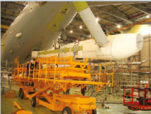
A330 MRTT Refuelling Boom System Cradle and Trolley

Focused on Aerospace and Defence sector, LANGA INDUSTRIAL has developed a wide range of Industrial Solutions for our customers as an evidence of its notable Design and Innovation Capabilities.