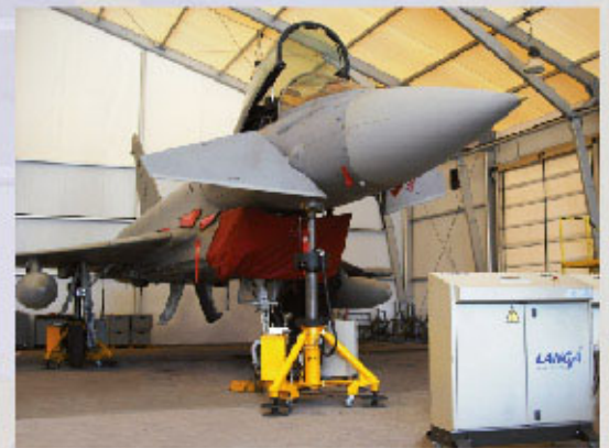
Automatic PLC Controlled System - HELPS for Jacking / Leveling and Weighing. Optional automatic safety nuts operation. Semiautomatic Electrohydraulic powerpack