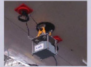
i JACK© - Jacking level monitoring