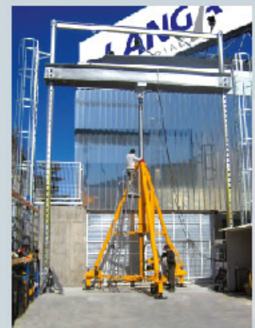
Jacking Fixtures Load Tests & Maintenance

Towing Tractors Other Lifting Solutions Test Benches Tools