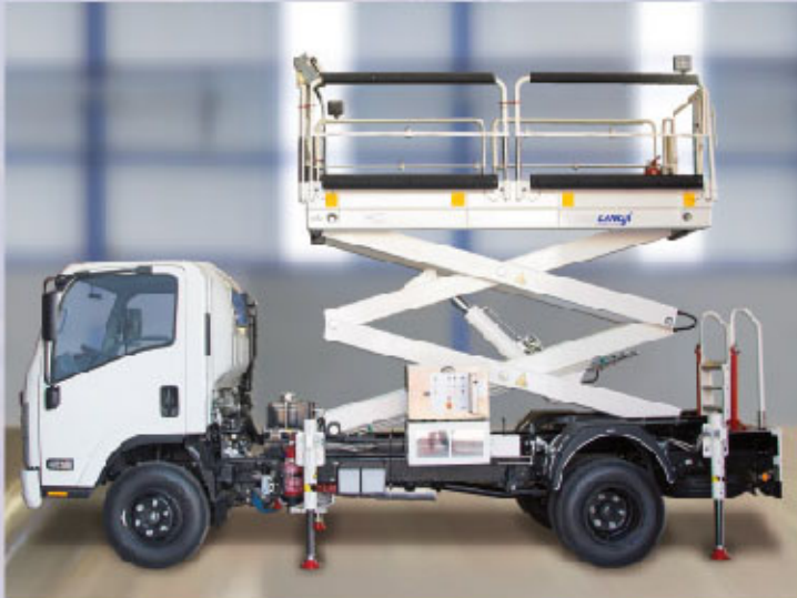
MAINTENANCE PLATFORMS & STAIRS Towable or self-propelled