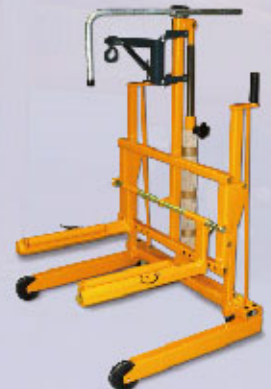
WHEEL DOLLY CHANGERS