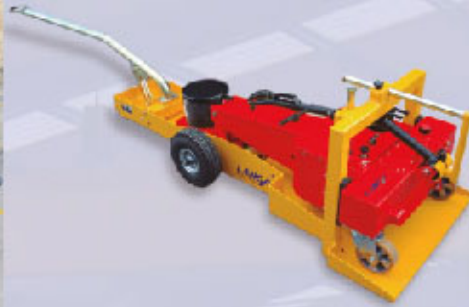
JACK TRANSPORT CART