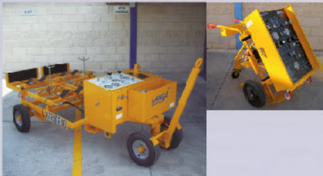
NITROGEN & OXYGEN CARTS

Hangar and ramp towable type, high pressure (380 bar) and low pressure (25 bar). 1, 2, 4, 6 bottles configuration and optional booster. Also available 24 bottle truck mounted.