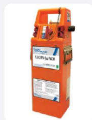
12/24V GA Pack