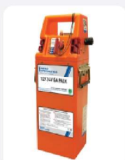
12/24V GA Pack