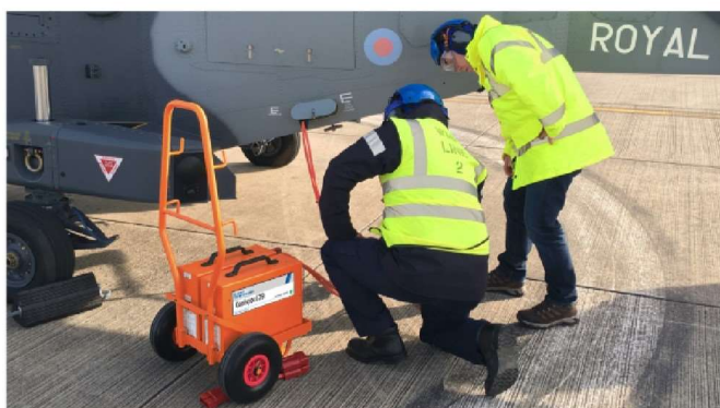
Coolspool 29 Twin: starting Lynx Wildcat