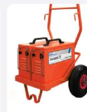
Coolspool 29 Twin